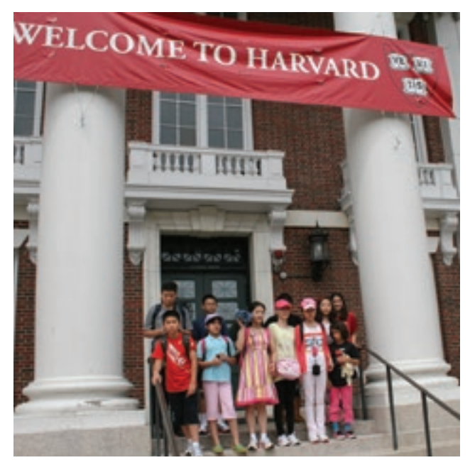
Middle School students in GSC's Summer Program at Harvard University.

This program is more demanding than our Standard Program. Students attend a partnering school for 3-6 weeks. Students are fully immersed in the curriculum of the school. The program includes weekend activities, as well as visits to top American universities.