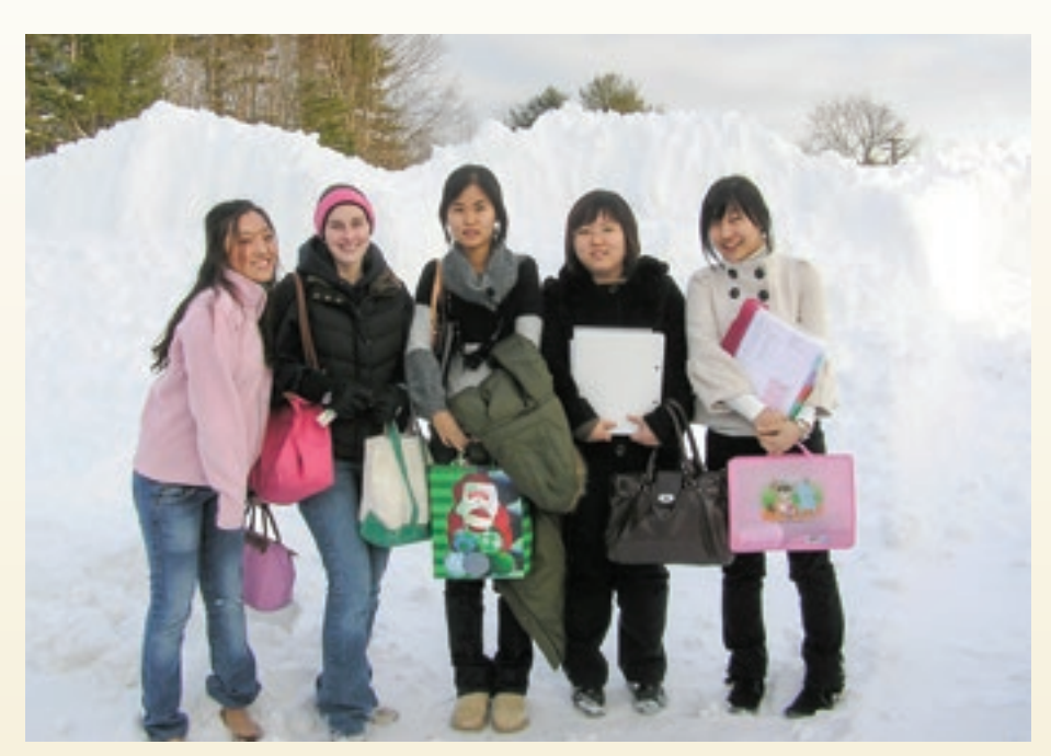
Students enjoying a winter snow in New England.